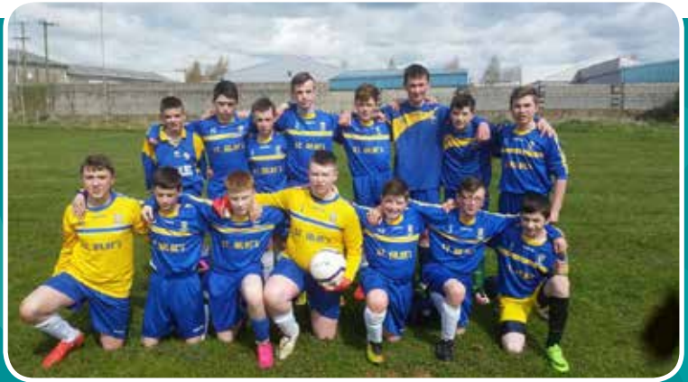
The under 14 soccer team who are through to the semi-final of the FDC Southeast Munster cup

St Ailbes have had a very successful year so far on the soccer pitch. The first year team got as far as the Quarter final of the Collins Cup, lost out to a very good Killenaule side who went on to contest the final. The under 14 team are in the semi-final of the FDC Southeast Munster cup vs Clonmel Highschool on Friday. The under 19 team got as far as the quarter final of the FAIS MUNSTER John Murphy cup