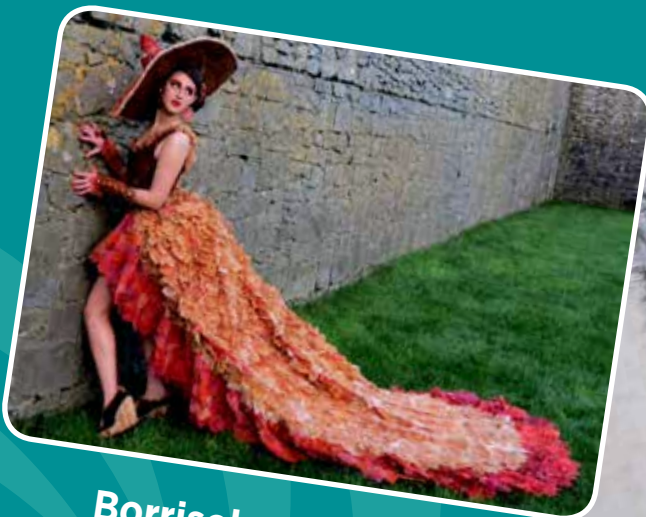
Borrisokane present Serendipi-TEA!