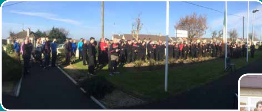
Pictured are students from Newport College celebrating proclamation day on Tuesday, 15th March, 2016.