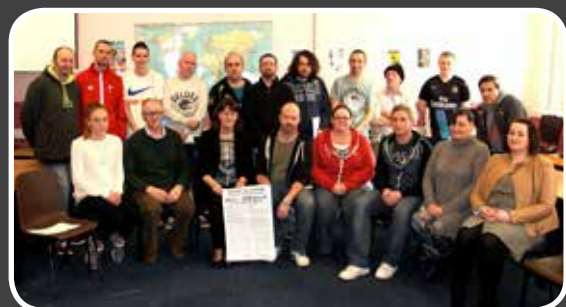
VTOS Clonmel Group Photo