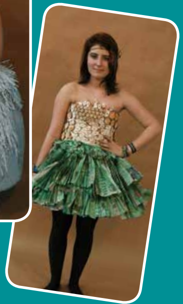
JUNK KOUTURE 2016 - COLÁISTE MUIRE CO-ED