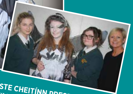
GAEL CHOLÁISTE CHEITÍNNS PRESENT THEIR ENTRY "LUMINOSITY"