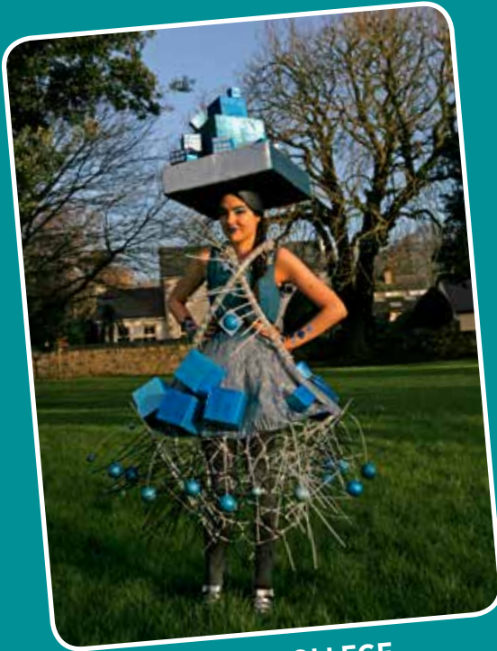
COMERAGH COLLEGE PRESENT GEOMETRIC GIRL